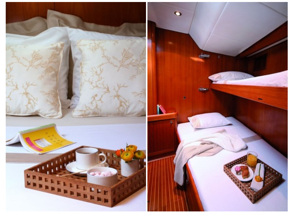
Guest cabin Guest cabin