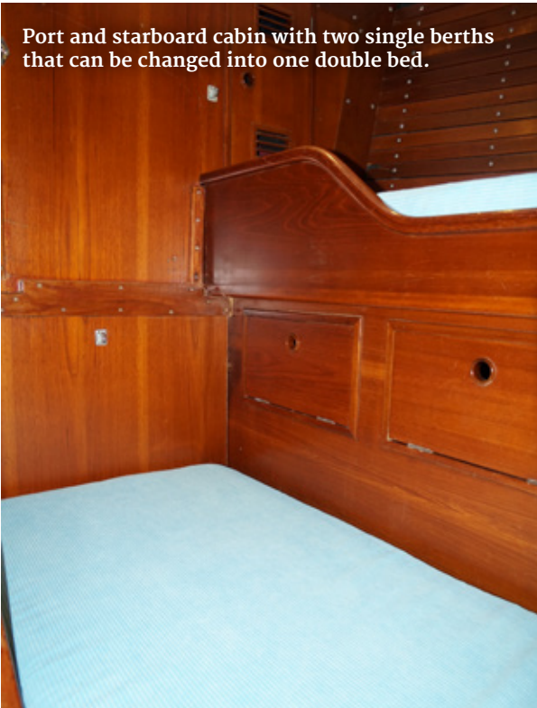
Port and starboard cabin with two single berths that can be changed into one double bed.