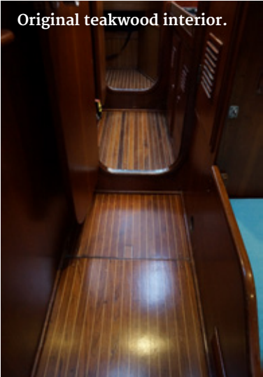
Original teakwood interior.