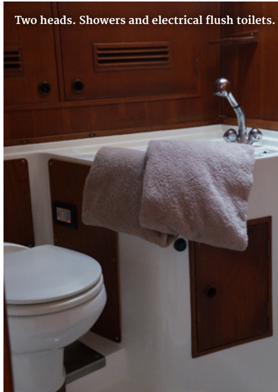
Two heads. Showers and electrical flush toilets.