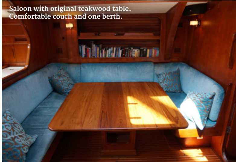
Saloon with original teakwood table. Comfortable couch and one berth.